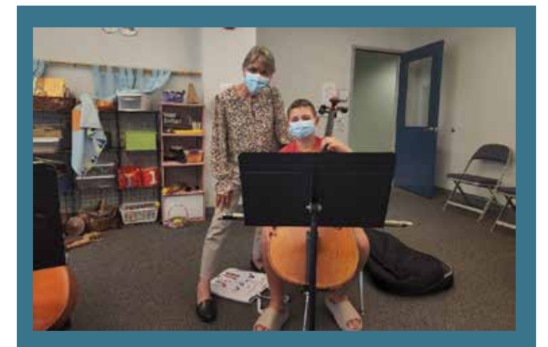
My staff and I had an opportunity to tour Settlement Music School's Willow Grove location. It was such a joy to watch bright young minds of tomorrow being taught and guided by world-class instructors. Settlement provides financial aid to more than 60% of their student population ensuring that arts education is accessible to all.