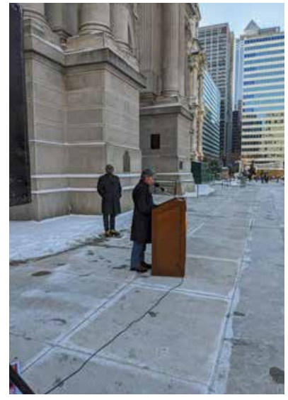
I spoke at the Asian Justice Rally in Philadelphia to advocate for equal rights and treatment for our AAPI community.