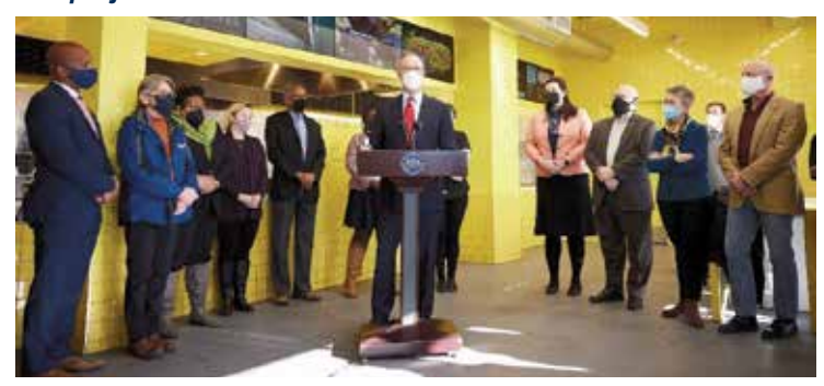
Our state minimum wage of $7.25 is currently the lowest in the region. Recently, I met with Governor Tom Wolf and other legislators in support of the workers at '&Pizza' in the Willow Grove Mall.