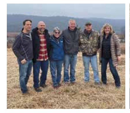
My colleagues from the Game and Fisheries Committee and I visited the Snow Geese and Black Ducks at the Middle Creek Wildlife Management Area.