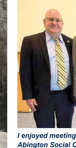
I enjoyed meeting with engaged student members of the Abington Social Change Initiative at Penn State Abington to discuss our state government.